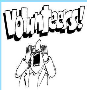
President - position vacant

Get to know your management team. Don't be a stranger, feel free to contact any of the team as they are willing to help