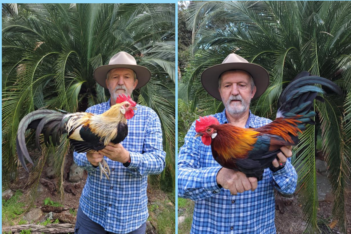
Author with North West Island Feral Fowl cockerels.

Reports on these remarkable birds have been published on the PWSA web site and I would encourage members to consider keeping this rare and remarkable Australian breed if you have capacity to keep roosters.