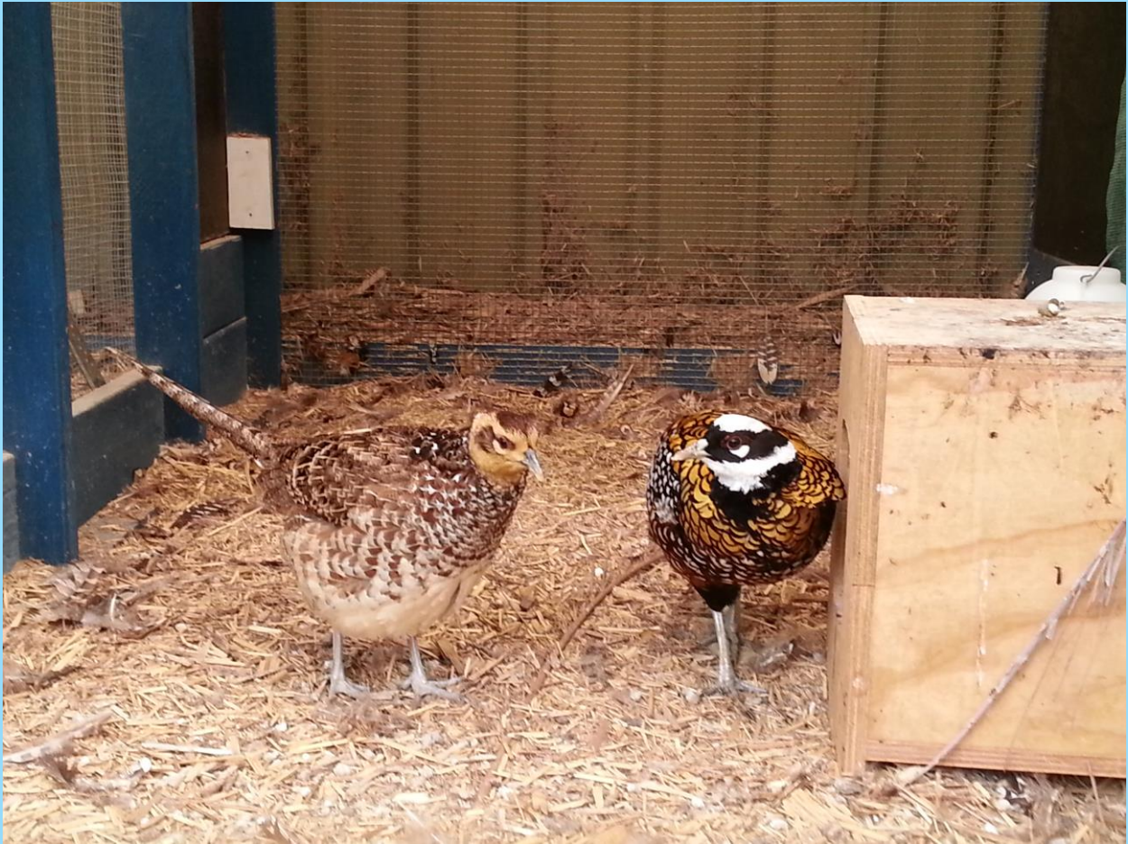
Photo - Reeves cock and hen birds