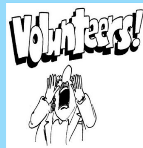
Publicity Officer - position vacant