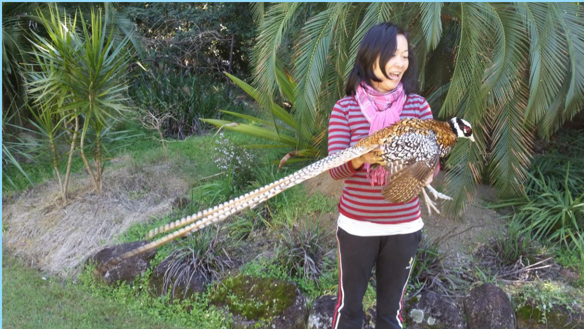
Cock Reeves pheasants need to be handled with care

The better coloured variants should be selected for breeding.